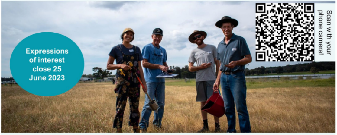
Join more than 1600 farmers working to increase farm productivity and improve the health of our waterways!